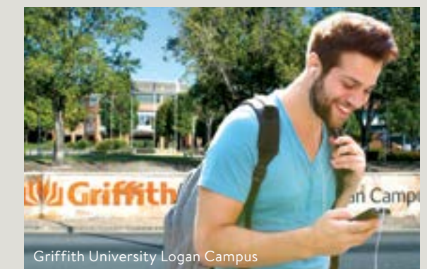
Griffith University Logan Campus

Schools and Colleges Killara is perfectly positioned to access a wide range of education facilities for children and adults at all stages of learning. For the kids, a handful of primary and secondary schools such as Canterbury College are only a few kilometres from home. And for the adults, higher learning awaits at the Griffith University Logan Campus, less than 9km away.