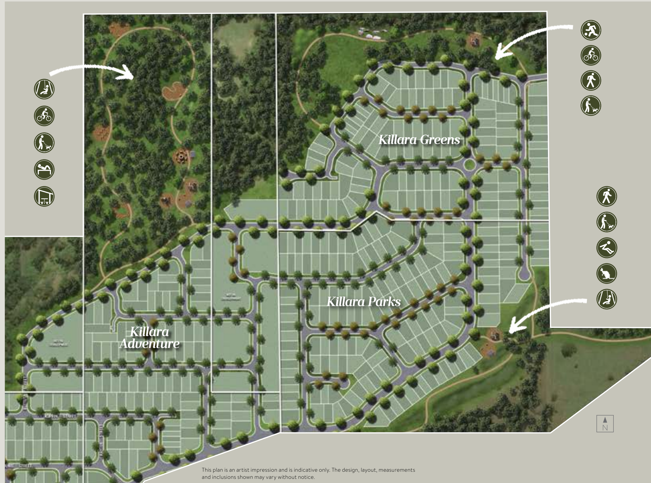
This plan is an artist impression and is indicative only. The design, layout, measurements and inclusions shown may vary without notice.

Be inspired by the outdoor recreational facilities and the healthy, active lifestyle that Killara promotes. Take to the adventure trail by bike or on foot. Unwind after a day of family fun and exercise with an evening stroll.